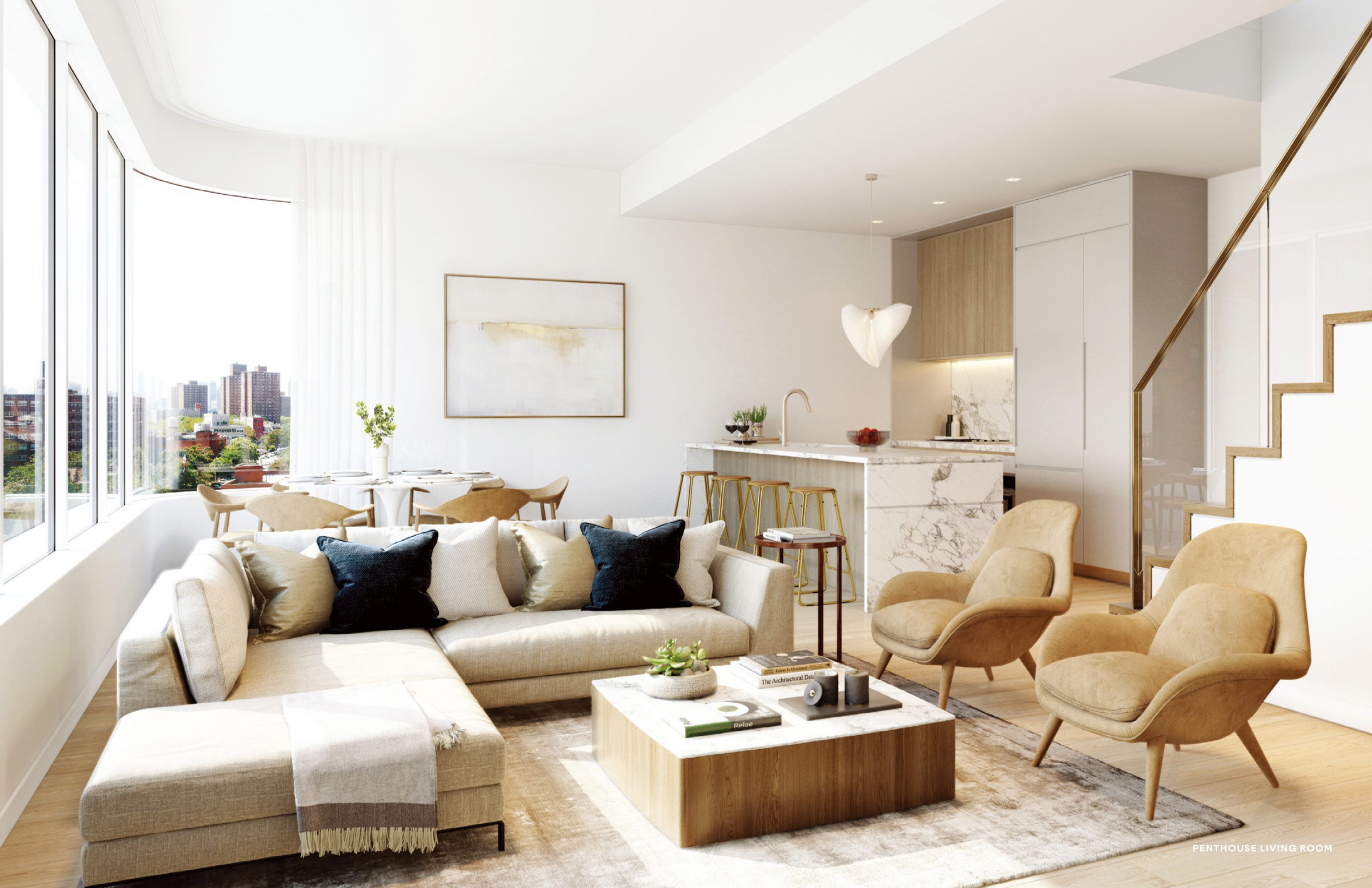
PENTHOUSE LIVING ROOM