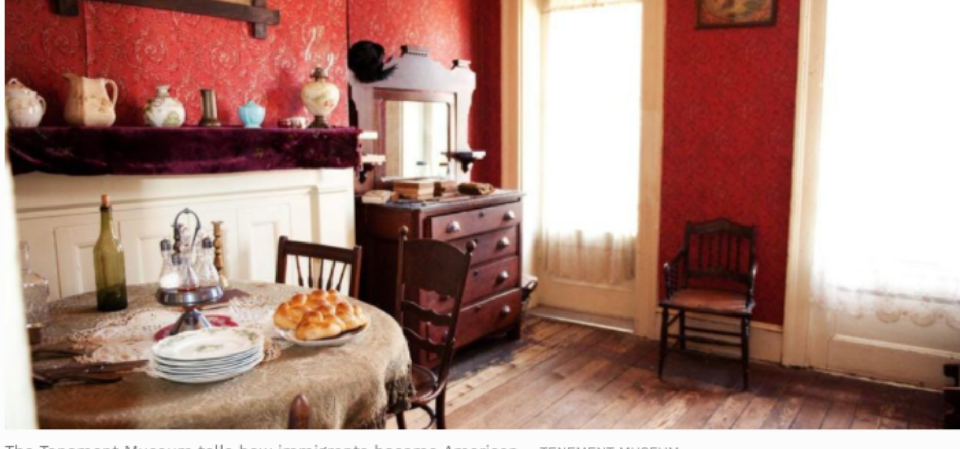
The Tenement Museum tells how immigrants became American.