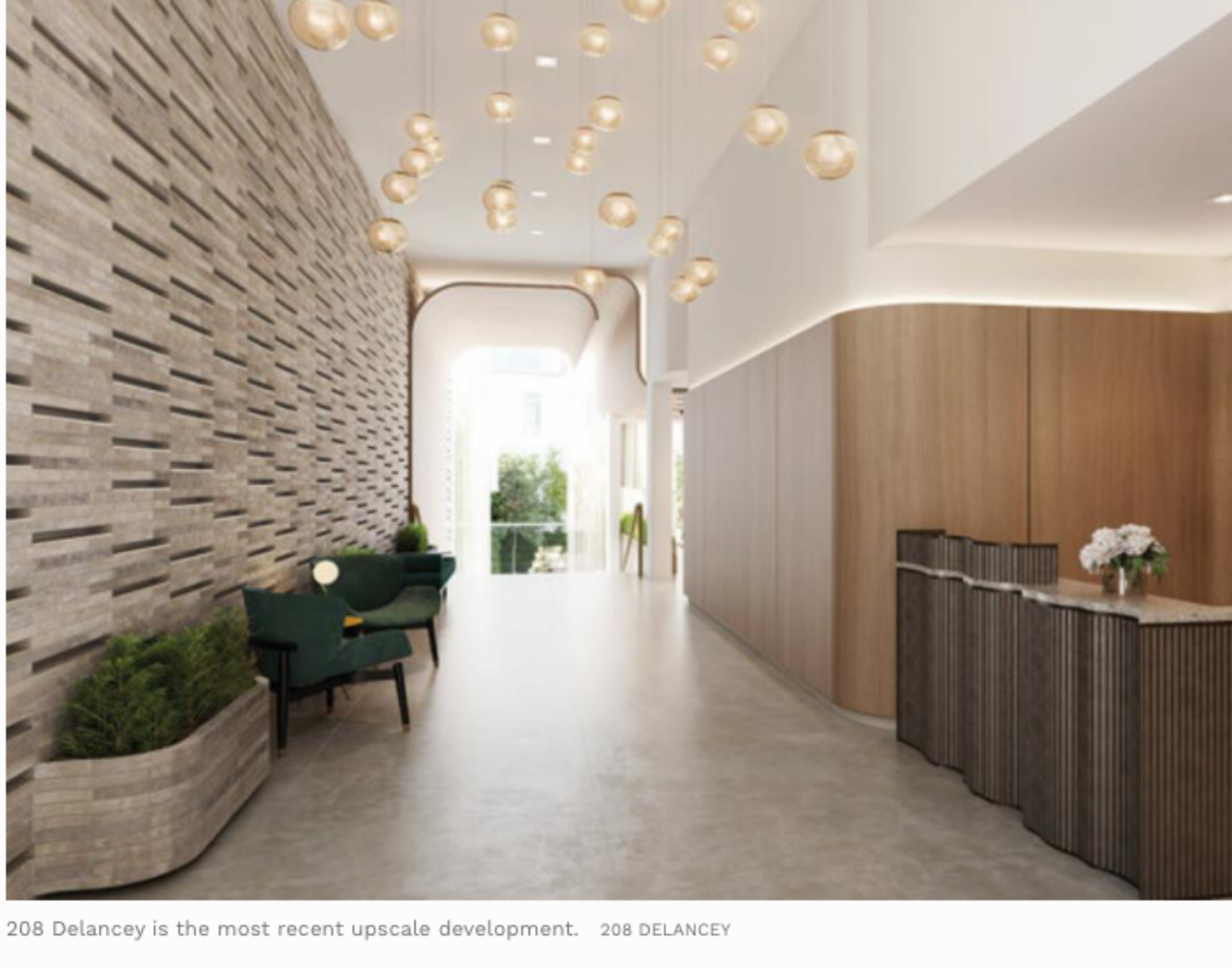
208 Delancey is the most recent upscale development. 208 DELANCEY

Long recognized for being ahead of the curve, the Lower East Side of Manhattan has been a vibrant neighborhood for quite some time, and is specifically known for its restaurant and bars scene. The Lower East Side of Manhattan is bounded by Houston Street, the Bowery, the Manhattan Bridge and the East River, with the neighborhood's center being Orchard Street. Its streets are lined with trendy places to drink and dance, and many of the area's synagogues, museums and restaurants serve as reminders of its immigrant history.