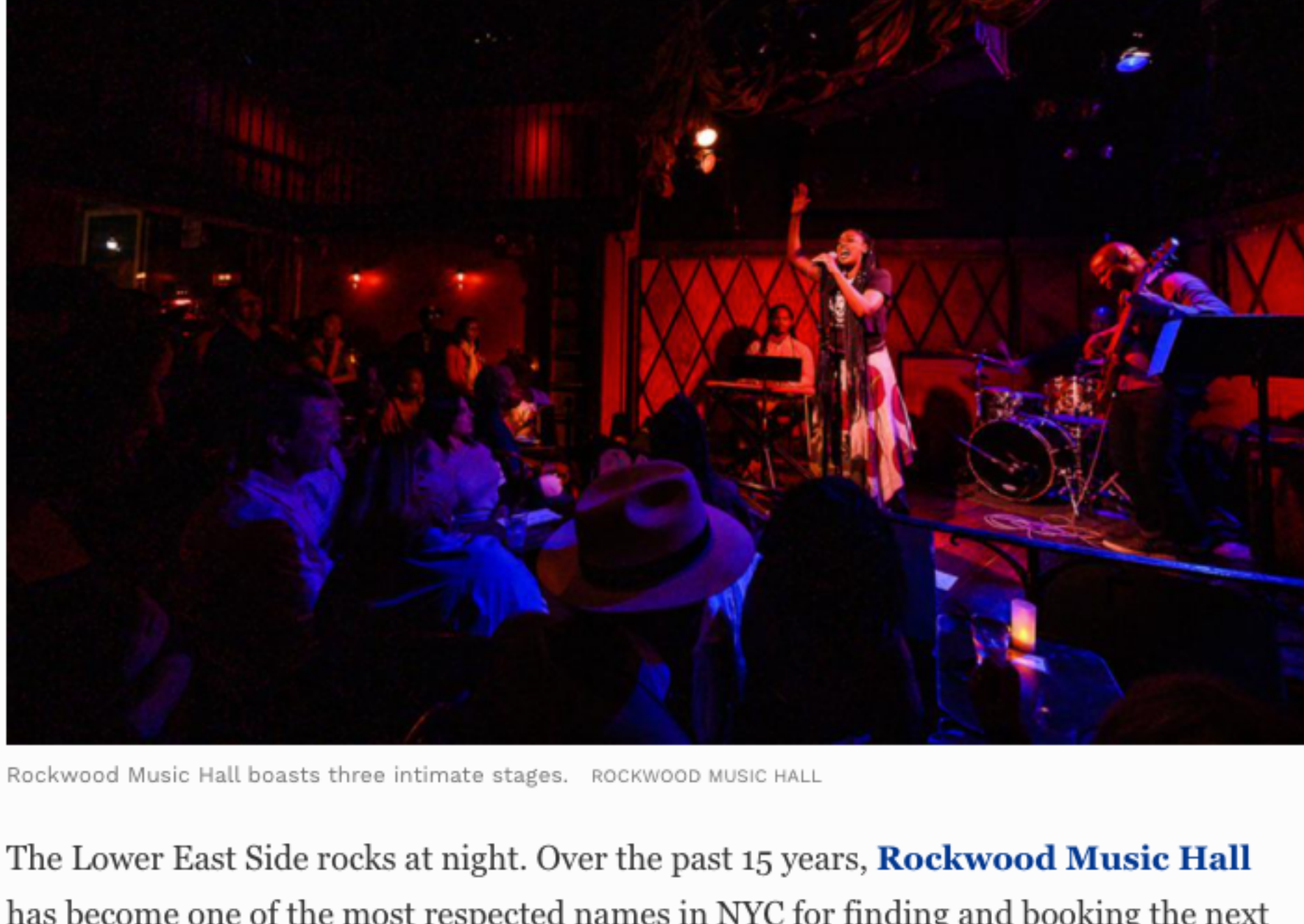
Rockwood Music Hall boasts three intimate stages.